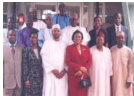
A group photograph of the members of the NIIA Governing Council