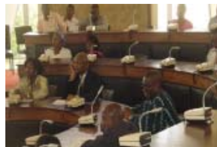
A cross-section of the audience at the NIIA Departmental seminar in Lagos